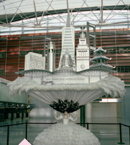
International Terminal, Beach Blanket Babylon, San Francisco Skyline Hat