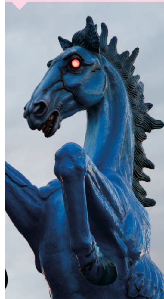
"Mustang" by Luis Jiménez — Location: approach to DIA on Peña Blvd. at Denver International Airport

This awesome program originated when a former mayor commissioned 14 pieces for the new main terminal, thanks to Atlanta's "Percent for the Arts" ordinance. Today? From the airport's Flickr page, "The program strives to meet the Department of Aviation's goal of