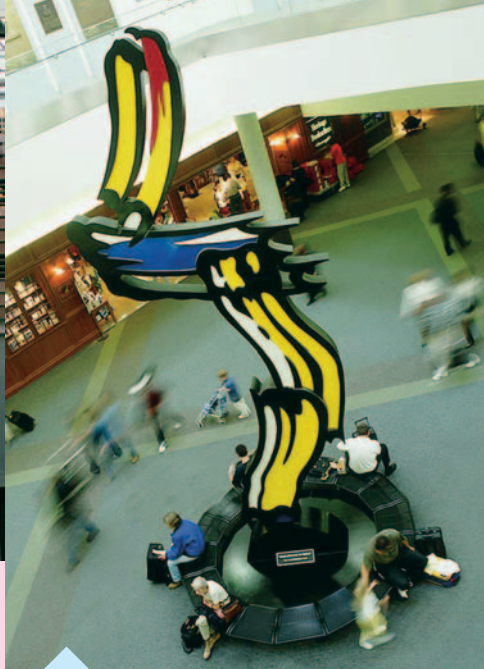
Brushstrokes in Flight, a 26-foot tall sculpture by the late Roy Lichtenstein at the Port Columbus International Airport.